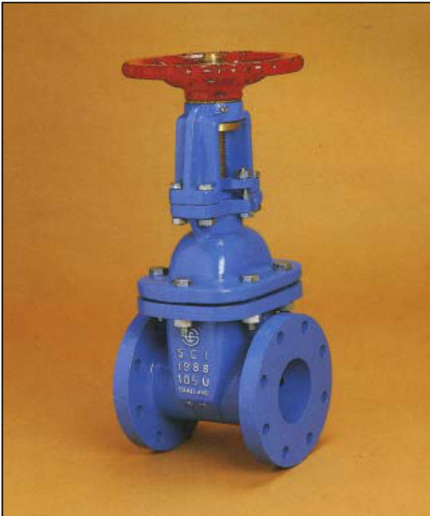
Fig.172 MODEL 105U